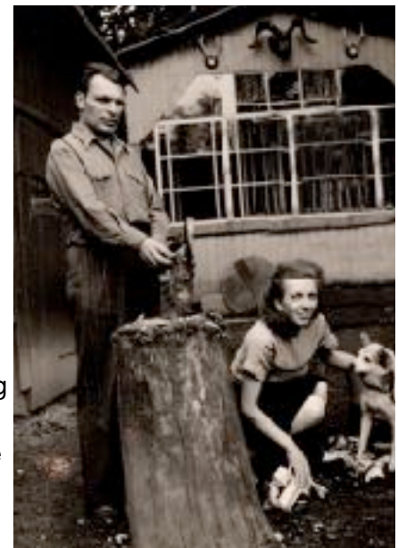
1948 in Goslar Germany