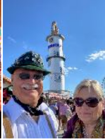
Oktoberfest Löwenbräu Lion Statue