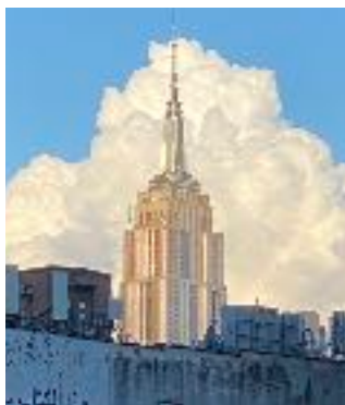
Empire State Building from High Line

In August we went to NYC, staying in lower Manhattan. We toured the 9/11 Memorial and explored the city. We hiked the amazing High Line on a crystal clear day where we took an amazing photo of the Empire State Building.