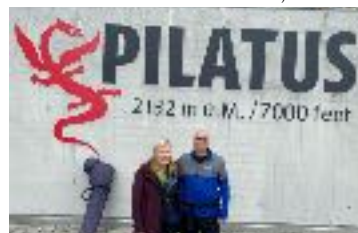
Mt Pilatus, Switzerland