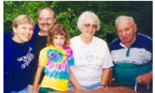
1999 at the farm in Wayland, NY

Treasure the people you love! Time is the most precious gift we have to give. We are grateful to so many who have given us that very special gift in 2022. All good things for 2023! To Happiness, Health and Continued Shenanigans!