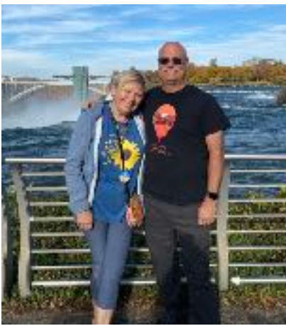
October 2022 - another visit to Niagara Falls