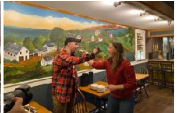
Traditional Sharing of the Cake