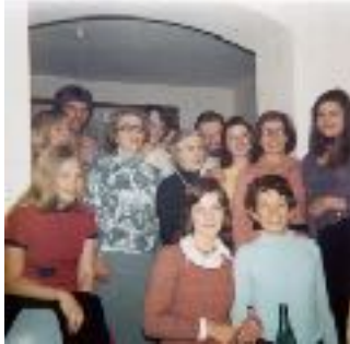
1971 in Munich