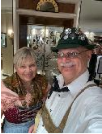
At Bayerischer Hof Munich