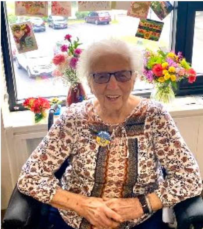
Sunday June 26, 2022 at Episcopal Church Home with 98th birthday cards