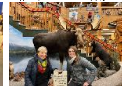
At Kittery Trading Post in Maine