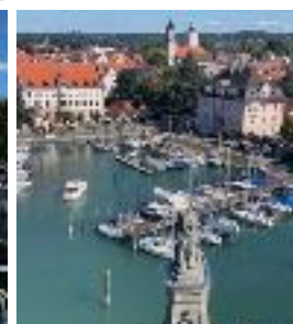
Lake Konstanz, Switzerland