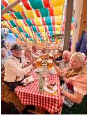
Our table at Oktoberfest