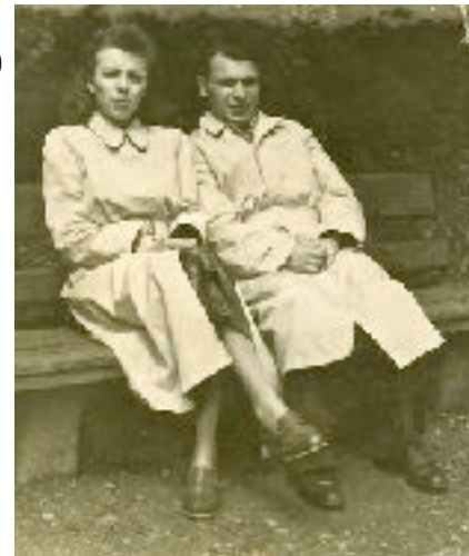
1948 Goslar Germany