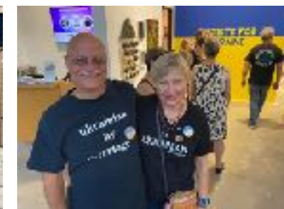
Artists for Ukraine at RoCo