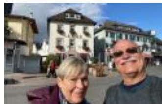
Hotel Krone Rudesheim am Rhein