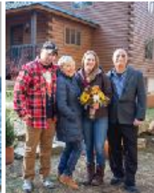
After Renewal of Vows