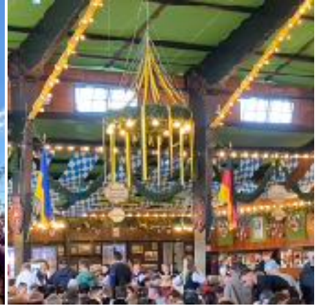
Augustiner Festhalle with Ukrainian Flag