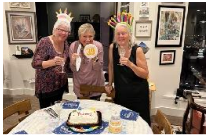
Nov 2022 The "Yahoo" girls celebrate