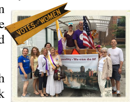
Decorated bike for the Parade to Susan B's