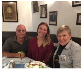
Bavaria German Restaurant