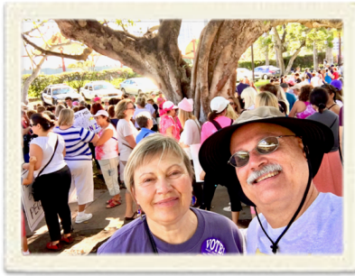
Miami Women's March