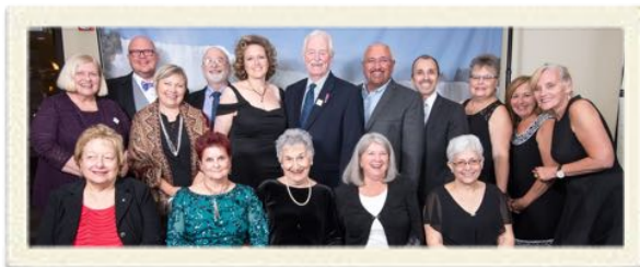
NYSFLT 100 Year Anniversary Gala