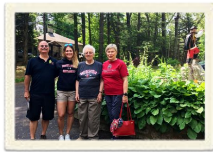
Idyllic Soyuzivka in the Catskill Mountains