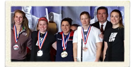
May 2017 Powerlifting