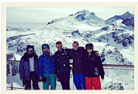
Tignes, ski resort in France. Alps