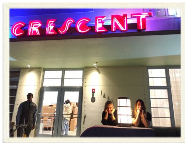
The Crescent Art Deco hotel on South Beach

picture. It is wonderful being with family on the holidays.