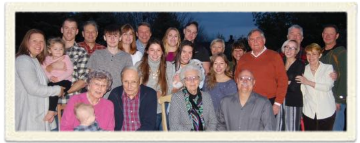
Thanksgiving at the Stars

Myers, Starowicz family members and other guests. Kids are growing up, making college decisions, graduated and "adulthood" and one was 8 months old.