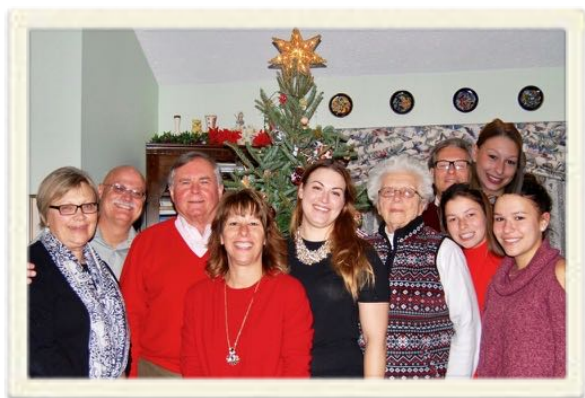
2016 Christmas Day Dinner at Myers House