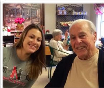
Lunch With Gramps