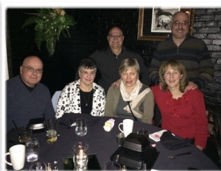
Dinner before "Capital Steps"