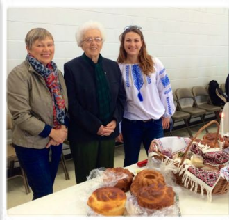
Blessing of the Easter food

Easter dinner was at the Star house. There were family members from all sides at the celebration. The day was sunny and warm and the food and company were great as always.