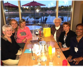
Birthday Girls Dinner