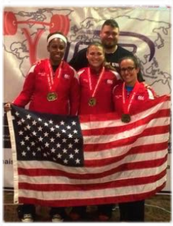
St Croix Competition

during its 10 days. We are club pass junkies and that gives us access to all the music at the festival.