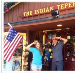
The Indian Tepee Gift Shop