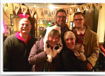
Holiday Festivities with Friends