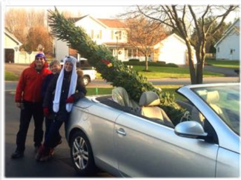
Our 2014 10 foot tree