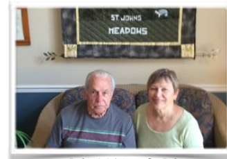
July 2014 at St Johns