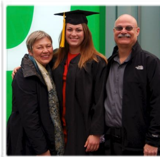
Graduation at Boston Garden