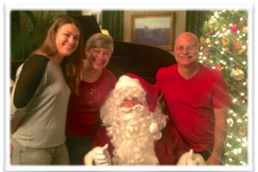
Eastman House with Santa