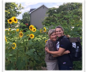
Going to Back to School