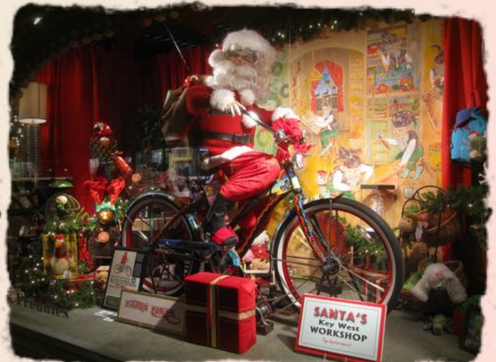
Santa in Key West