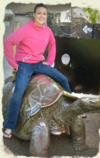
San Diego Zoo