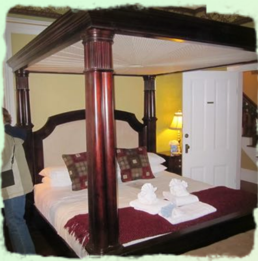
A room at the Inn

Each Inn had food and drinks along with rooms to view so we could see the amazing variety of places you can book. The weather was great and there was lots of SUNSHINE!