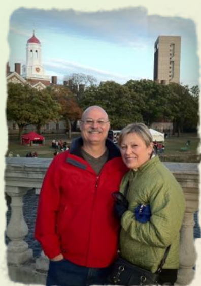
Overlooking Leverett Hall