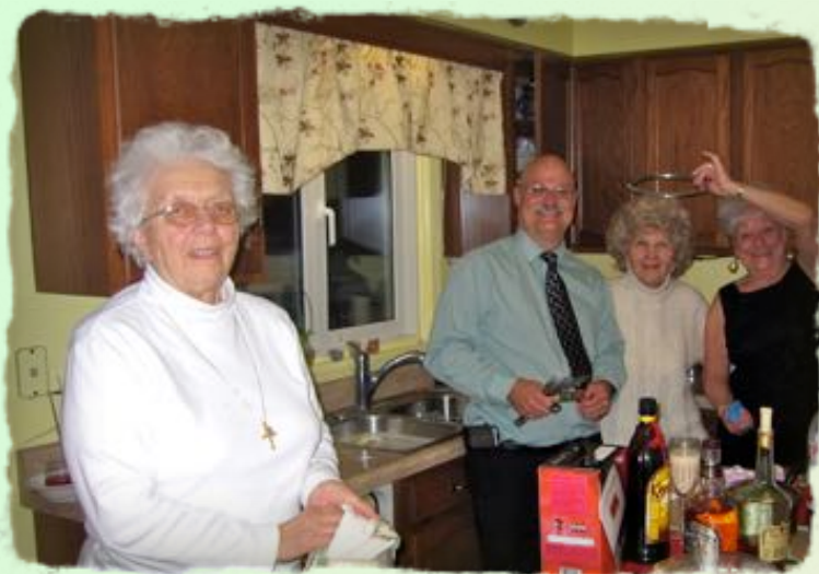
The Kitchen "Angels"