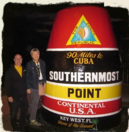
The traditional Key West Picture