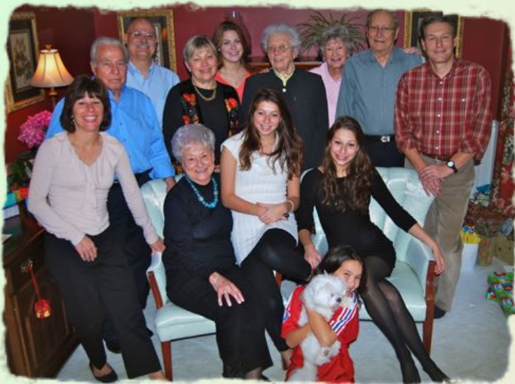
Thanksgiving at the Stars