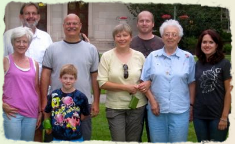
German Meetup Group at Carillon Concert