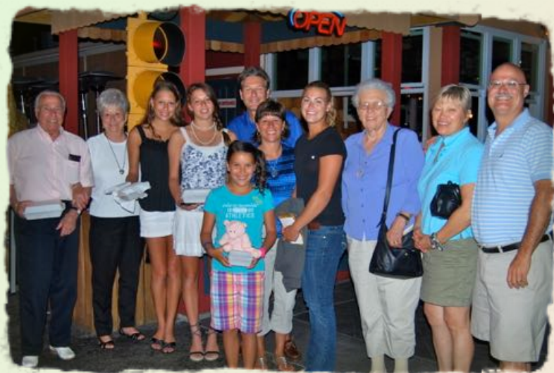
Family Dinner at Pelicans Nest