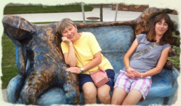
On one of the Chairs on Parade