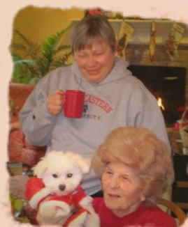
Flo loved Tucker