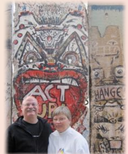
The Berlin Wall in the Newseum