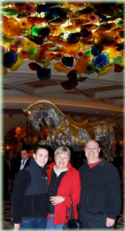
Bellagio's Chihuly Ceiling