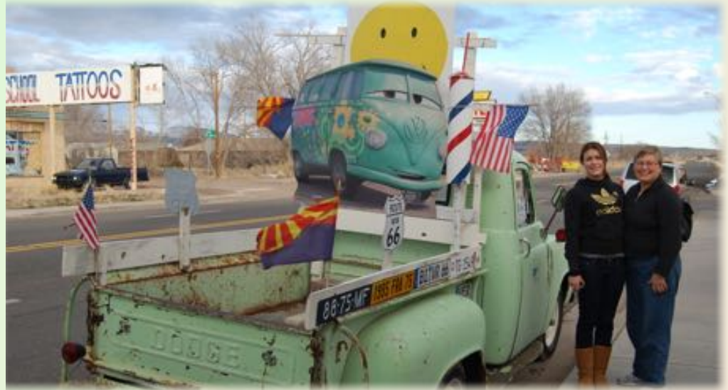
The old Route 66 Truck Stop