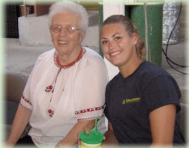
Helping at Ukrainian Festival