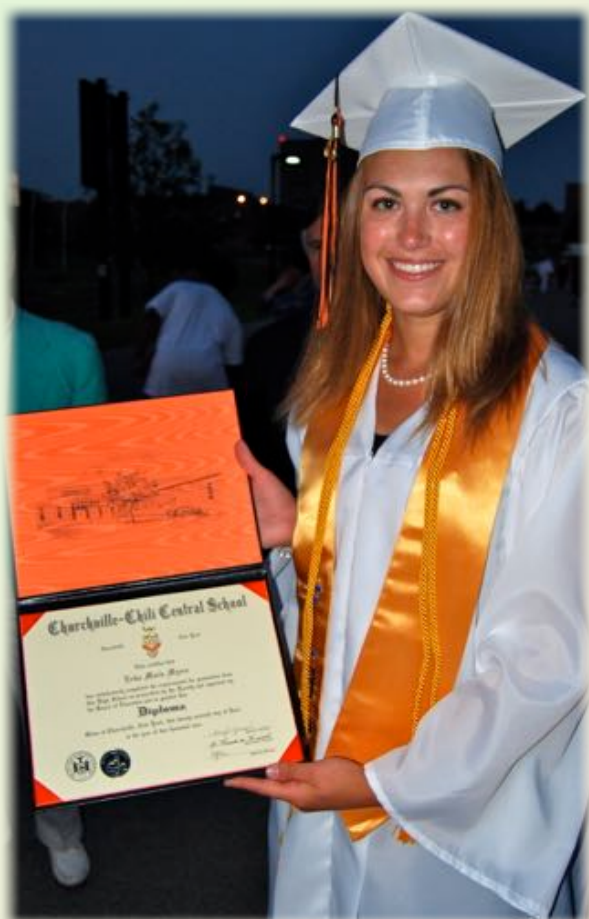
Churchville-Chili Graduation 2009