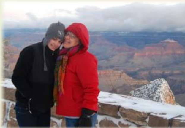
Grand Canyon 2009