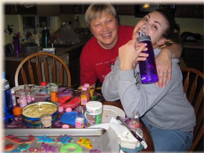
Having fun making Christmas Cookies.