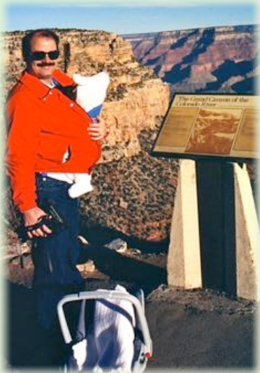
Grand Canyon Feb 1991