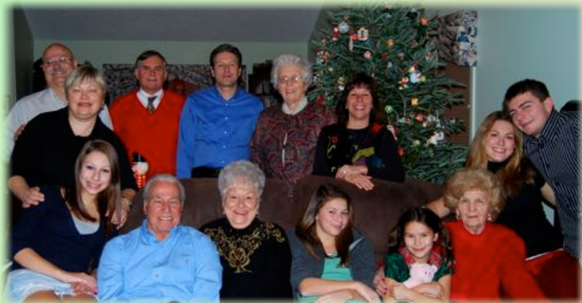
Christmas Day 2008 at the Myers

Christmas 2008 found our family together in the traditional way with the traditional guests. We are grateful for that blessing and that all were healthy enough to be there. Family is very important to us and it is great to once again spend Christmas with everyone!