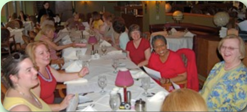
The ladies awaiting their lunch.