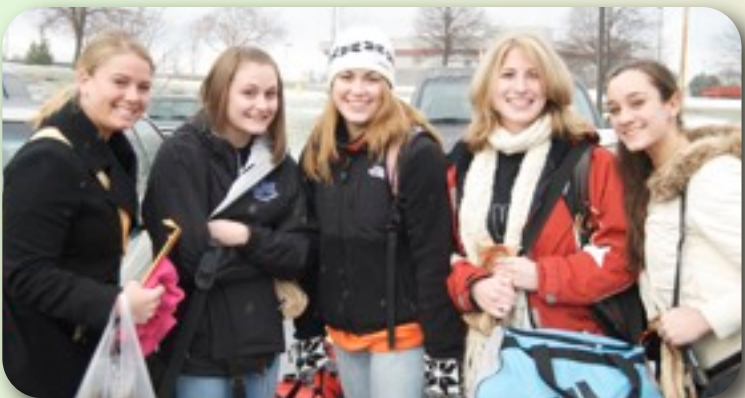
Heading off to NYSPHAA Championships (States!)