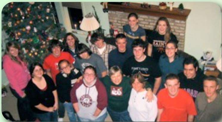
German 4/5, Exchange Students, Seminarians and friends decorate the Myers 2007 Christmas tree.