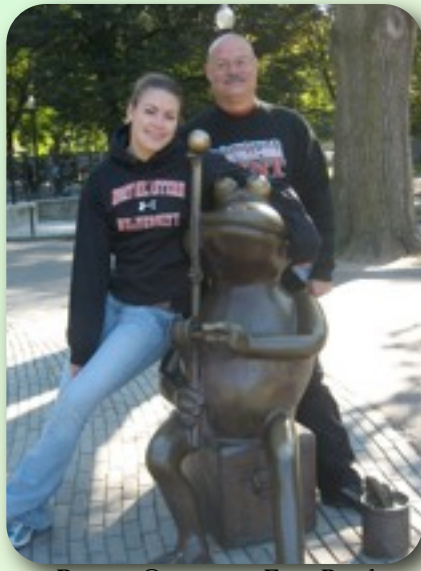
Boston Commons Frog Pond