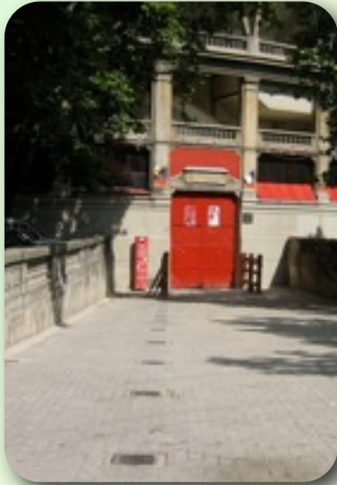
Pamplona, Plaza de Toros