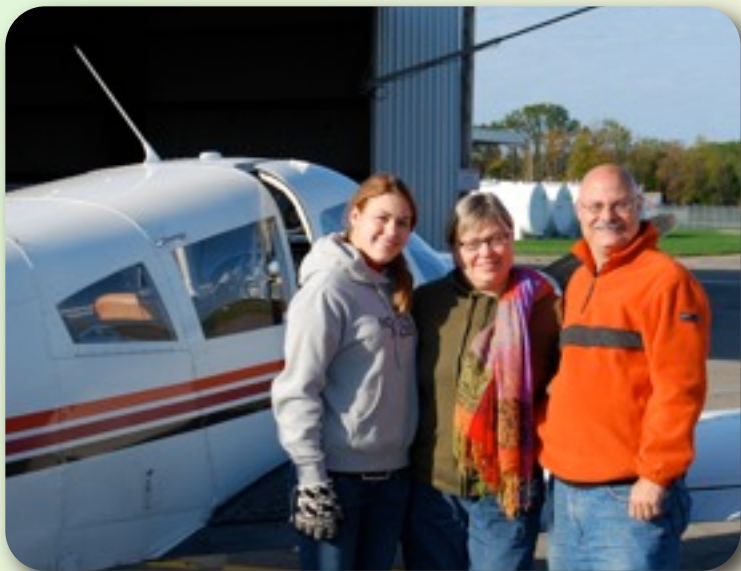
Flight from Brockport, over Niagara Falls and back again.

At last year's Eastman House Oscars Party, we bid on a "Plane ride over Niagara Falls" and won! In October we met the donor/pilot