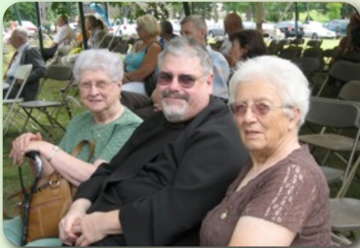
August Vidpost 2008