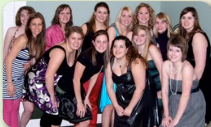
Seniors on the swim team.