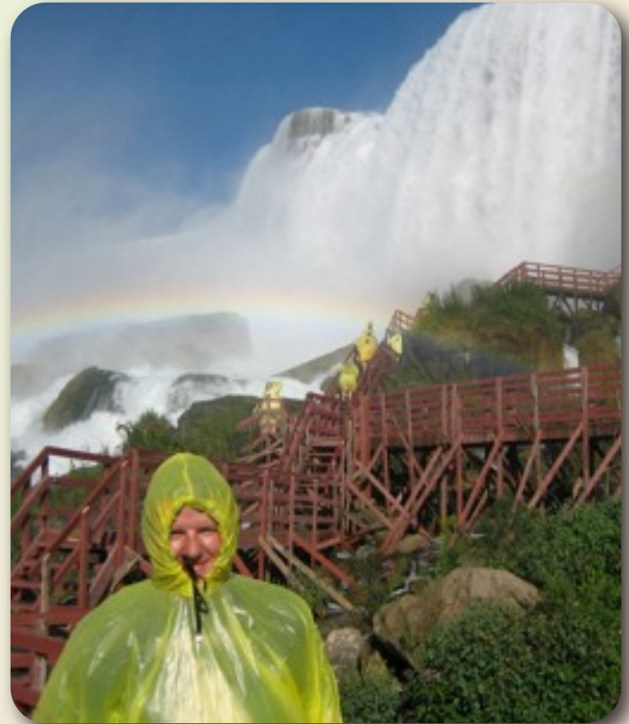
Taras at Cave of the Winds