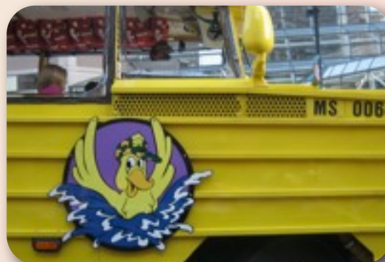
Boston Duck Boats!

We went to Boston to visit Northeastern University. Many of the schools we have visited are places where the parents would be very happy to live too! Boston was certainly one of them. After doing the University visit we took a Duck Boat ride around the city and into the river. We highly recommend the ride. They give a good tour of the city. All the historic sites drew us and we even stayed in the old city jail now called the Liberty Hotel.