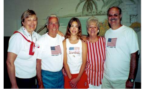
July 4th in Florida

watched fireworks from the pier at the trailer park and were able to see 10-20 different firework displays going at the same time. We went to St. Pete's Beach and played in the