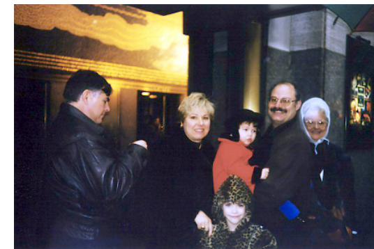
At Radio City Music Hall for the 97 Christmas Show featuring the Rockettes.