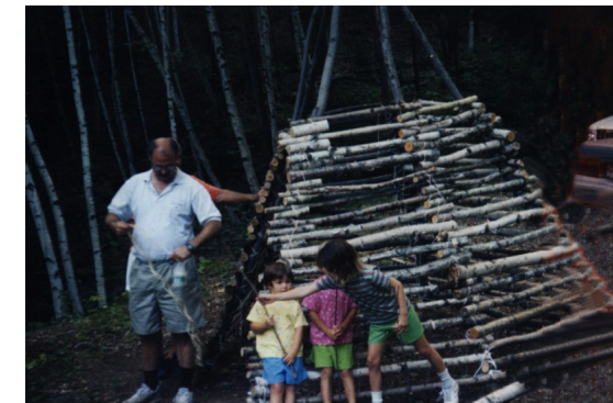
"Five Birch" Teepee