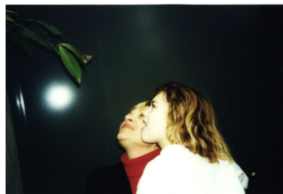
The Wonders of the Butterfly Conservatory

At Easter we spent three great days at Niagara Falls and saw the Butterfly Conservatory, the Falls in all their glory and just generally enjoyed each other's company. We also got a surprise daredevil show at Table Rock. We were eating lunch when a gymnastics team member climbed up on one of the rock posts and his buddy did a handstand with him. You could hear the whole restaurant gasp!