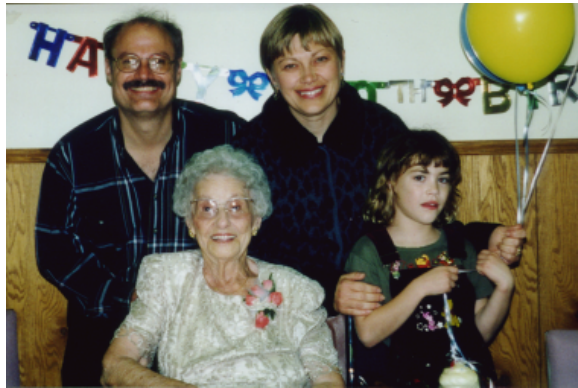
Great Grandma turns 100! 1898-1998